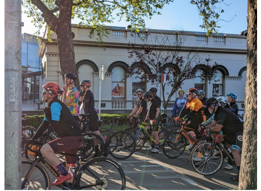
Spark Renewables sponsored the 2022 Gears & Beers fundraising for the Wollundry Rotary Club

There will be a range of opportunities for the regional community hosting the DEH project to benefit, including a large community benefit scheme. We have heard different ideas for how the community could benefit, including electricity discount schemes, improved telecommunications, community solar farms, upgraded community club facilities and improved health services. We are keen to hear any ideas from community members as the community benefit scheme is developed. If you wish to have a chat or organise a time to meet, please contact us at info@dinawanenergyhub.com or leave a message at 1300 271 419 .